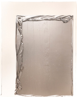
Haruna Shinagawa Peel off the paint #193 Acrylic on canvas / 2022 180 x 140 cm $5,000 USD