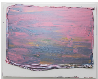
Haruna Shinagawa Peel off the paint #204 Acrylic on canvas / 2022 110 x 140 cm $3,500 USD