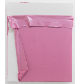
Haruna Shinagawa Peel off the paint #211 Acrylic on canvas / 2022 30 x 25 cm $400 USD