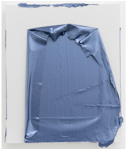
Haruna Shinagawa Peel off the paint #212 Acrylic on canvas / 2022 30 x 25 cm $400 USD