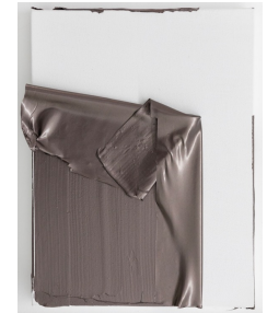
Haruna Shinagawa Peel off the paint #243 Acrylic on canvas / 2022 40 x 30 cm $600 USD