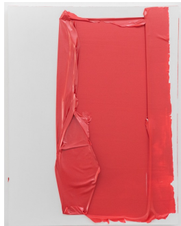
Haruna Shinagawa Peel off the paint #190 Acrylic on canvas / 2022 90 x 70 cm $1,750 USD