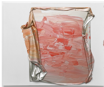
Haruna Shinagawa Peel off the paint #205 Acrylic on canvas / 2022 90 x 110 cm $2,500 USD