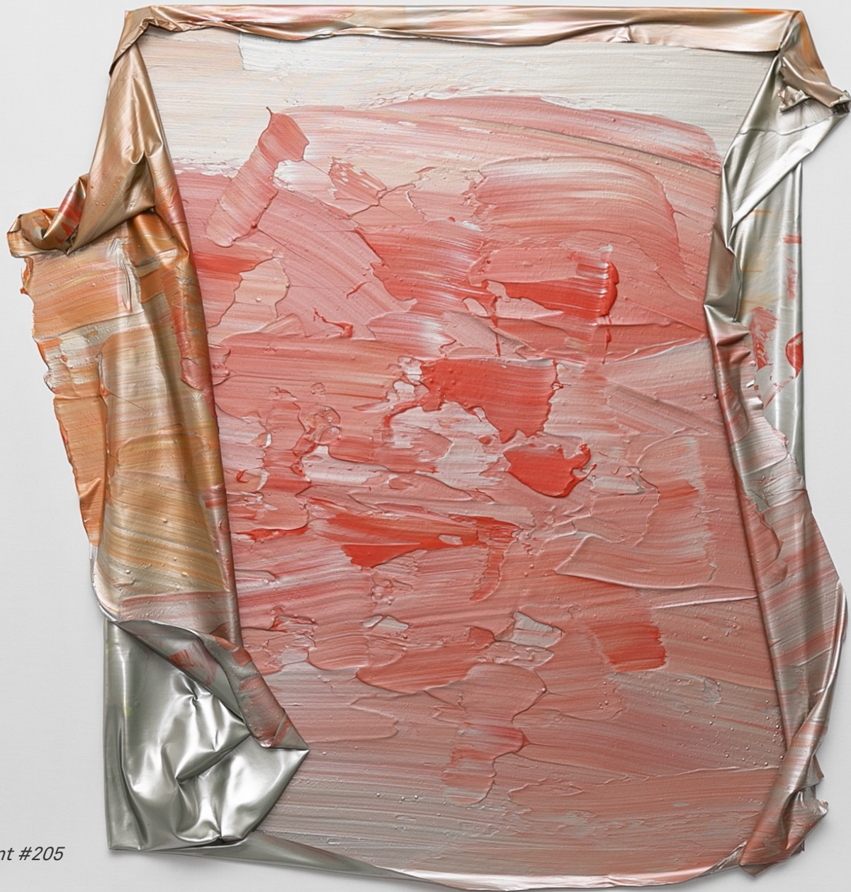
Peel off the paint #205