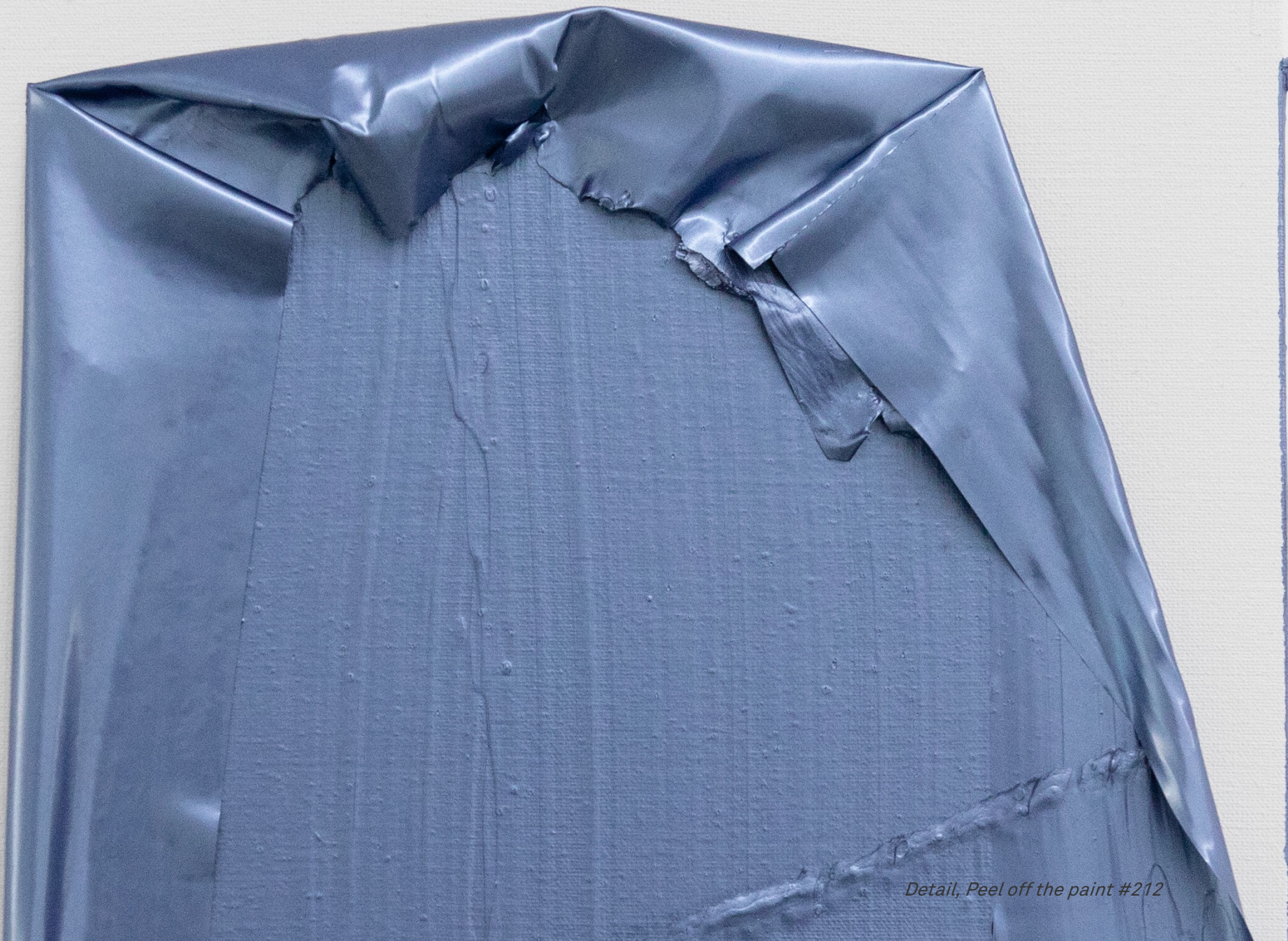
Detail, Peel off the paint #212