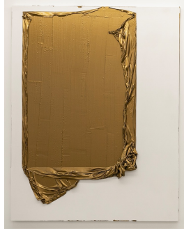
Haruna Shinagawa Peel off the paint #191 Acrylic on canvas / 2022 180 x 220 cm $5,000 USD