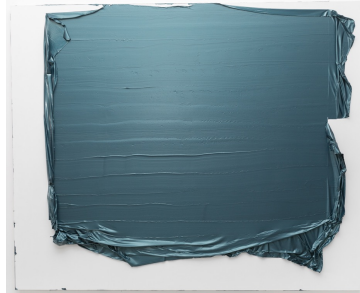
Haruna Shinagawa Peel off the paint #214 Acrylic on canvas / 2022 180 x 220 cm $7,500 USD