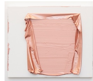
Haruna Shinagawa Peel off the paint #209 Acrylic on canvas / 2022 60 x 50 cm $1,000 USD