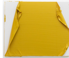
Haruna Shinagawa Peel off the paint #225 Acrylic on canvas / 2022 25 x 30 cm $400 USD