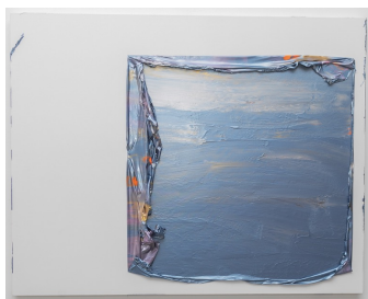
Haruna Shinagawa Peel off the paint #205 Acrylic on canvas / 2022 110 x 140 cm $3,500 USD