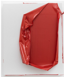
Haruna Shinagawa Peel off the paint #226 Acrylic on canvas / 2022 30 x 25 cm $400 USD