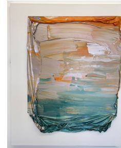
Haruna Shinagawa Peel off the paint #235 Acrylic on canvas / 2022 140 x 110 cm $3,500 USD