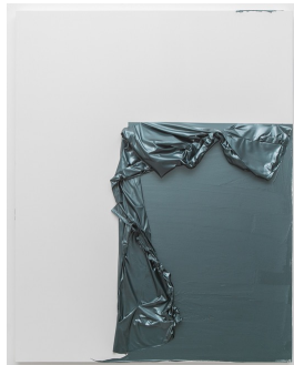
Haruna Shinagawa Peel off the paint #232 Acrylic on canvas / 2022 140 x 110 cm $3,500 USD