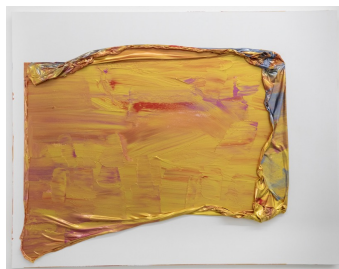
Haruna Shinagawa Peel off the paint #206 Acrylic on canvas / 2022 110 x 140 cm $3,500 USD