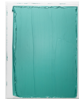
Haruna Shinagawa Peel off the paint #195 Acrylic on canvas / 2022 180 x 140 cm $5,000 USD