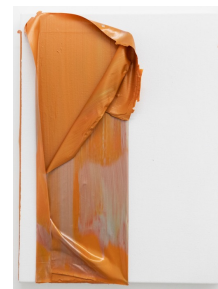
Haruna Shinagawa Peel off the paint #241 Acrylic on canvas / 2022 40 x 30 cm $600 USD