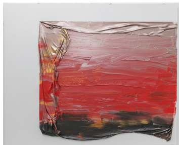
Haruna Shinagawa Peel off the paint #231 Acrylic on canvas / 2022 180 x 220 cm $7,500 USD