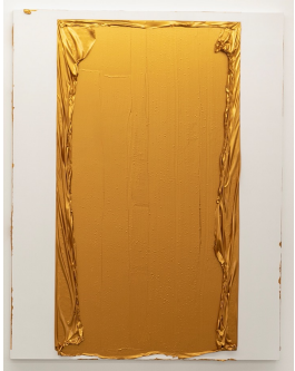
Haruna Shinagawa Peel off the paint #192 Acrylic on canvas / 2022 180 x 140 cm $5,000 USD