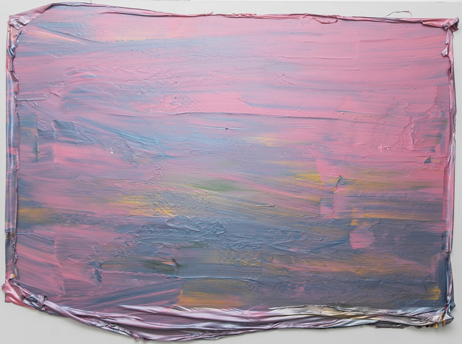
Peel off the paint #204