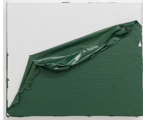
Haruna Shinagawa Peel off the paint #223 Acrylic on canvas / 2022 25 x 30cm $400 USD