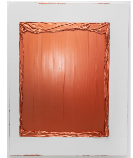
Haruna Shinagawa Peel off the paint #197 Acrylic on canvas / 2022 180 x 140 cm $5,000 USD