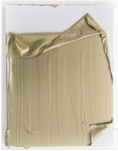
Haruna Shinagawa Peel off the paint #246 Acrylic on canvas / 2022 40 x 30 cm $600 USD