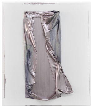
Haruna Shinagawa Peel off the paint #238 Acrylic on canvas / 2022 60 x 50 cm $1,000 USD