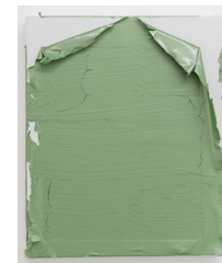
Haruna Shinagawa Peel off the paint #227 Acrylic on canvas / 2022 30x 25 cm $400 USD