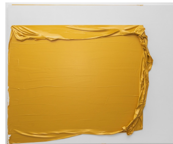
Haruna Shinagawa Peel off the paint #230 Acrylic on canvas / 2022 180 x 220 cm $7,500 USD