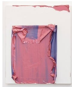
Haruna Shinagawa Peel off the paint #207 Acrylic on canvas / 2022 60 x 50cm $1,000 USD