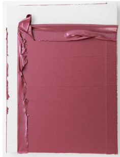
Haruna Shinagawa Peel off the paint #247 Acrylic on canvas / 2022 40 x 30 cm $600 USD