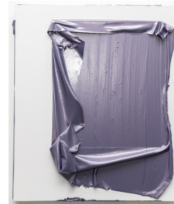
Haruna Shinagawa Peel off the paint #208 Acrylic on canvas / 2022 60 x 50 cm $1,000 USD